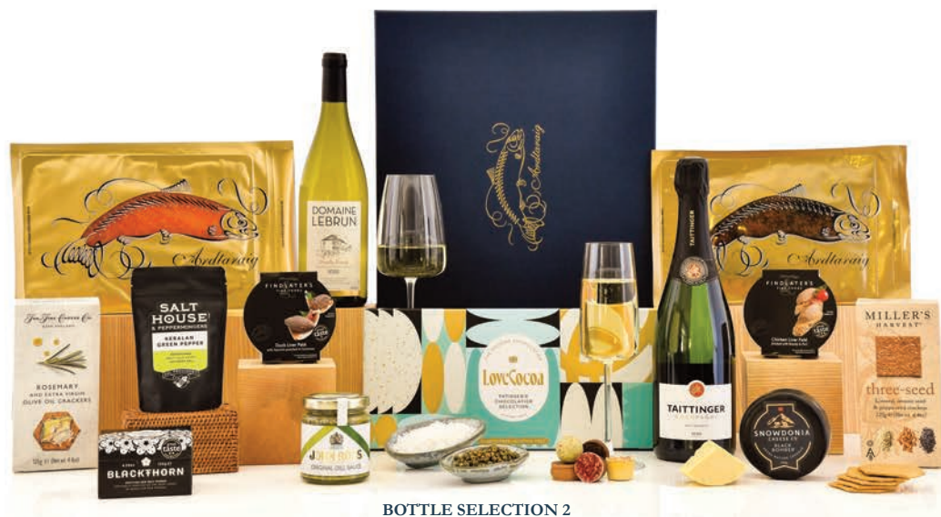
BOTTLE SELECTION 2

Order Online - www.ardtaraig.com or call us on 01292 521000 ALL BROCHURE PRICES INCLUDE VAT, POSTAGE & PACKING.