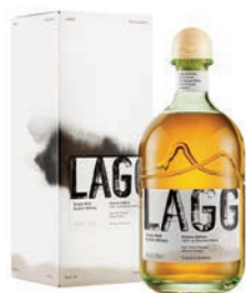
Lagg Kilmory 75cl Heathery smoke with red berries and vanilla