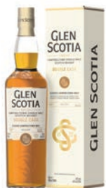
Glen Scotia Double Cask 75cl Rich and spicy with stoned fruits and a maritime note.