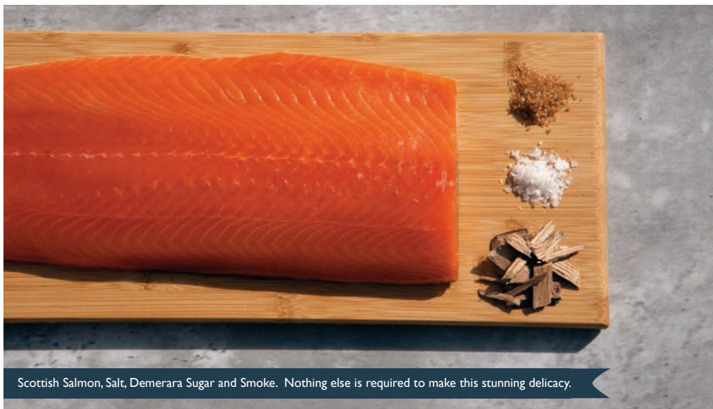
Scottish Salmon, Salt, Demerara Sugar and Smoke. Nothing else is required to make this stunning delicacy.

Order Online - www.ardtaraig.com or call us on 01292 521000 ALL BROCHURE PRICES INCLUDE VAT, POSTAGE & PACKING.