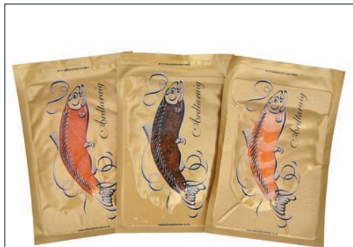
T43 - Smokery Box 3 - £48.00