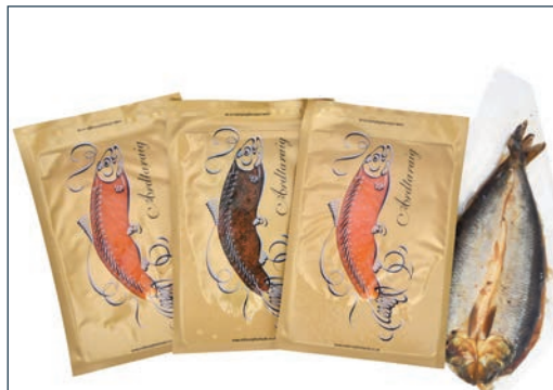
T44 - Smokery Box 4 - £54.00