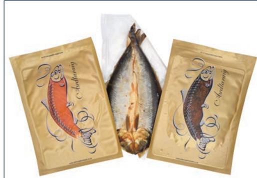
T41 - Smokery Box 1 - £45.00

Our Ardtaraig smokery selection boxes offer a cross section of our core product range and simply put, these fly off the shelves. Offering superb value for money when comparing against purchasing items individually, these boxes make the perfect gift, or for stocking up on your Ardtaraig favourites.