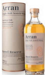
Arran Barrel Reserve 75cl A fresh, fruity and vibrant dram