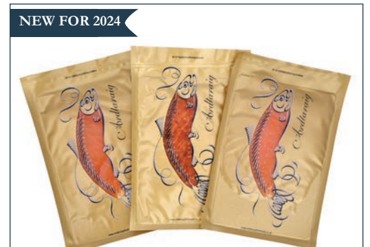
T46 - Smokery Box 6 - £50.00