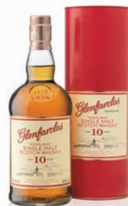
Glenfarclas 10yo 75cl Candied fruit, cinnamon, cloves and wisps of sherry sweetness.