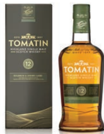
Tomatin 12yo 75cl Malty with red apples, pears and gentle nuttiness.