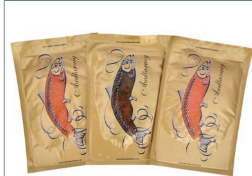
T42 - Smokery Box 2 - £46.00