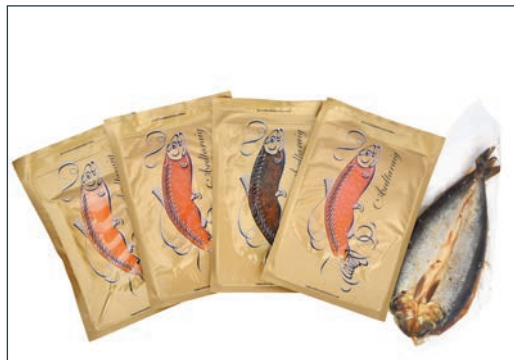
T45 - Smokery Box 5 - £62.00