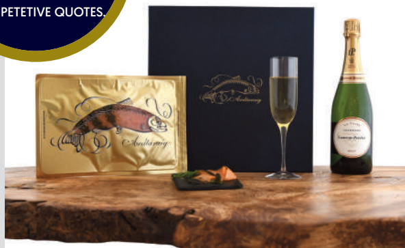
A27 - LAURENT PERRIER CHAMPAGNE & GRAVDLAX

Presented in a Blue Gift Box and Outer Case