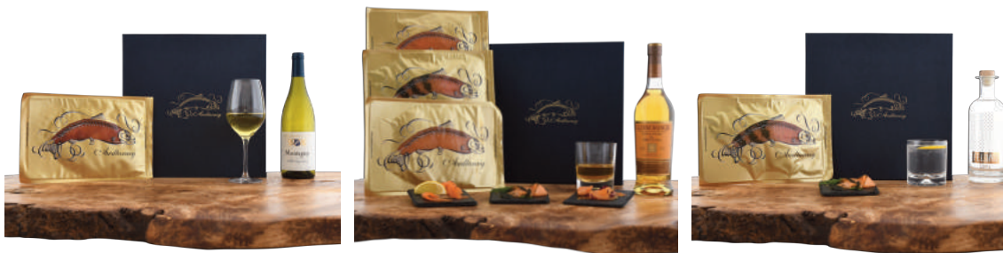
A138 - MONTAGNY, WHITE WINE WITH BEETROOT GRAVDLAX

We then carefully pack your chosen items into our blue gift box and outer case enclosing a card containing your message to make the perfect gift.