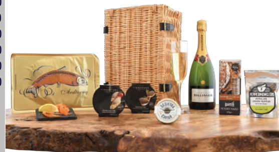
A54C - BOLLINGER CHAMPAGNE, TRADITIONAL SMOKED SALMON & CAVIAR

ADD A 30G TIN OF OUR ACIPENSER BAERI CAVIAR TO THE HAMPER FOR A SUPPLEMENT OF £30.