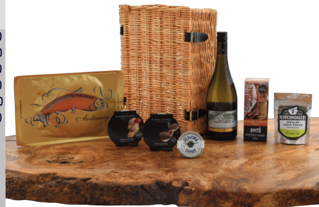
A160C - PREMIER CRU CHABLIS WITH ORGANIC SMOKED SALMON & CAVIAR

ADD A 30G TIN OF OUR ACIPENSER BAERI CAVIAR TO THE HAMPER FOR A SUPPLEMENT OF £30.