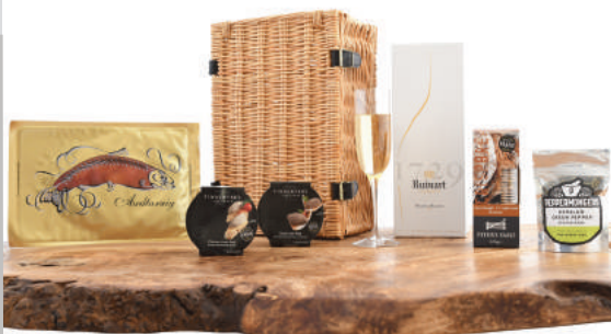
A157 - RUINART BLANC DE BLANCS CHAMPAGNE & BEETROOT GRAVADLAX

ADD A 30G TIN OF OUR ACIPENSER BAERI CAVIAR TO THE HAMPER FOR A SUPPLEMENT OF £30.