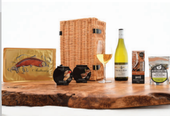
A169 - POUILLY FUMÉ & BEETROOT GRAVADLAX

ADD A 30G TIN OF OUR ACIPENSER BAERI CAVIAR TO THE HAMPER FOR A SUPPLEMENT OF £30.