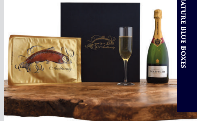
A134 - BOLLINGER CHAMPAGNE & BEETROOT INFUSED GRAVDLAX

Presented in a Blue Gift Box and Outer Case